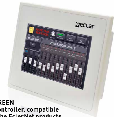
WpMScreen digital controller, compatible with all the EclerNet products